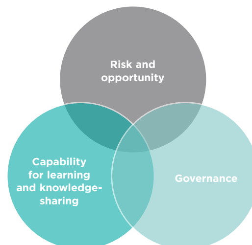
Figure 1: Three overarching themes

In the next section we briefly describe our research approach and then present the key findings from our work.